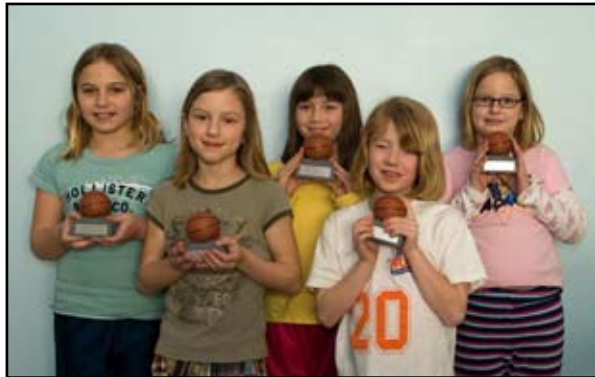
Girls Intramural Basketball • 3 rd and 4 th Grade