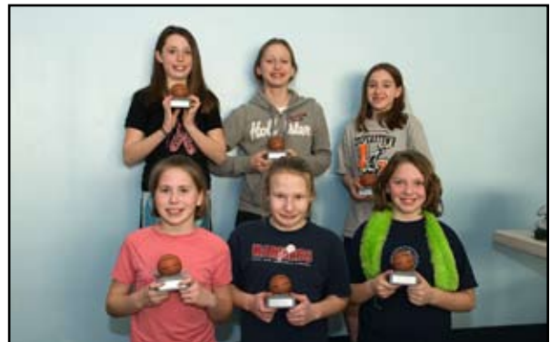
Girls Intramural Basketball • 5 th and 6 th Grade