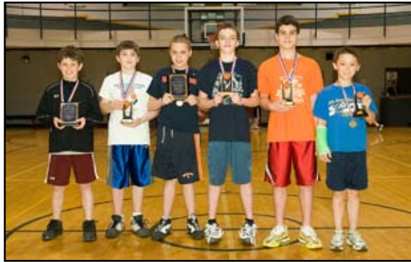
Boys Travel Basketball Award Winners