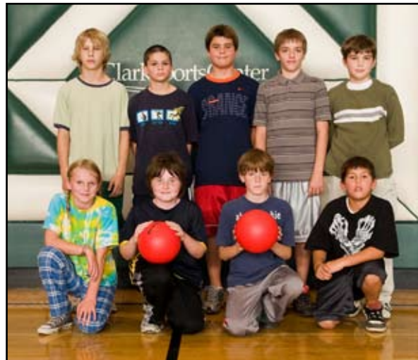
Kids Dodgeball 5 th & 6 th Grade Champs • Orioles