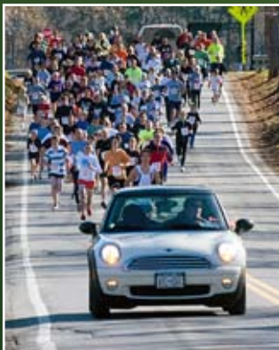
Coop Loop 8 • November 2, 2008

Phone • (607) 547-2800 Fax • (607) 547-4100 www.clarksportscenter.com