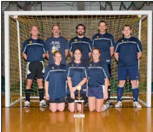
Sunday Fall Futsal Champs • The Troopers