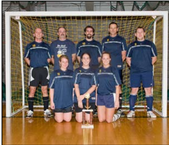
Sunday Fall Futsal Champs • The Troopers