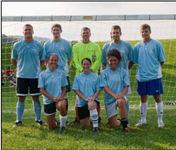
Sunday Summer 7 On 7 Soccer Champs • The Crew