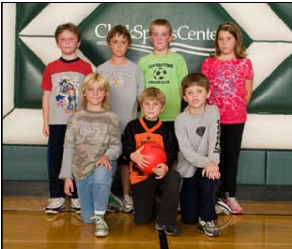
Kids Dodgeball 3 rd & 4 th Grade Champs • Tornadoes