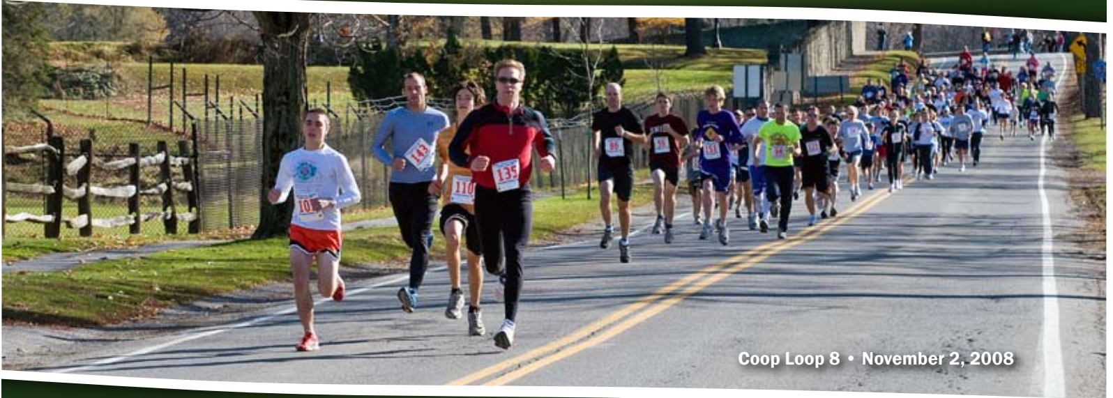
Coop Loop 8 • November 2, 2008

What's Inside: Fetterman Award Winner Upcoming Programs Coop Loop Results