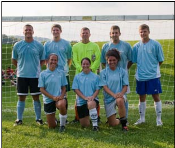
Sunday Summer 7 On 7 Soccer Champs • The Crew