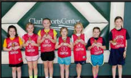
Girls Junior Intramural Basketball Playoff & Regular Season Champs