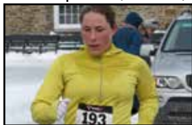
10k Female Winner