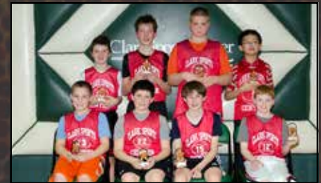
Boys Senior Intramural Basketball Playoff & Regular Season Champions