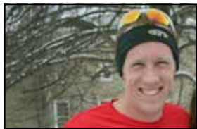
5k Male Winner