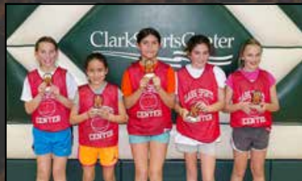
Girls Senior Intramural Basketball Playoff & Regular Season Champs