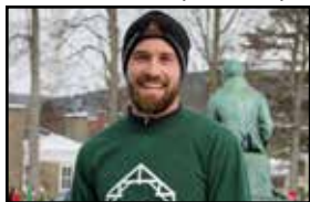
10k Male Winner