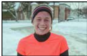
5k Female Winner