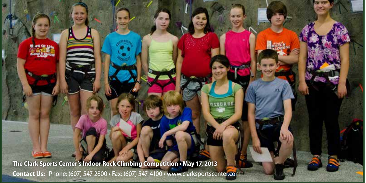
The Clark Sports Center's Indoor Rock Climbing Competition • May 17, 2013

Contact Us: Phone: (607) 547-2800 • Fax: (607) 547-4100 • www.clarksportscenter.com