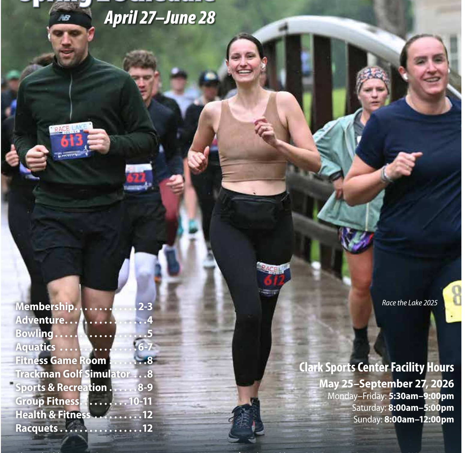
Race the Lake 2025